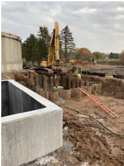
mini excavator being lowered in