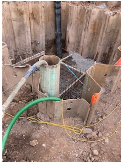
base forming on the first UV structure