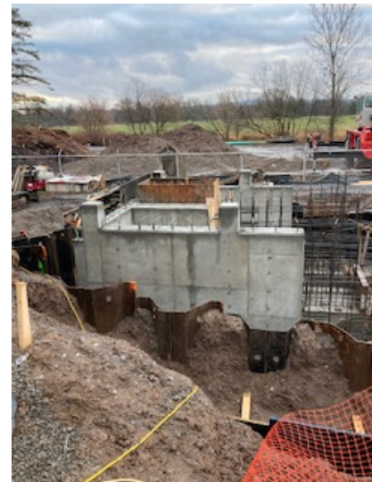
poured walls of the first UV structure

In October 2021, MA Bongiovanni started moving on site at our Wastewater Plant. They have cleared the site where the new UV system will be and proceeded forward with sheeting installation for bank support when digging and forming the structure. Part of the structure is formed and poured.