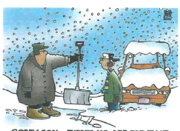
SORRY, SON...THERES NO APP FOR THAT