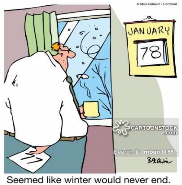
Seemed like winter would never end.